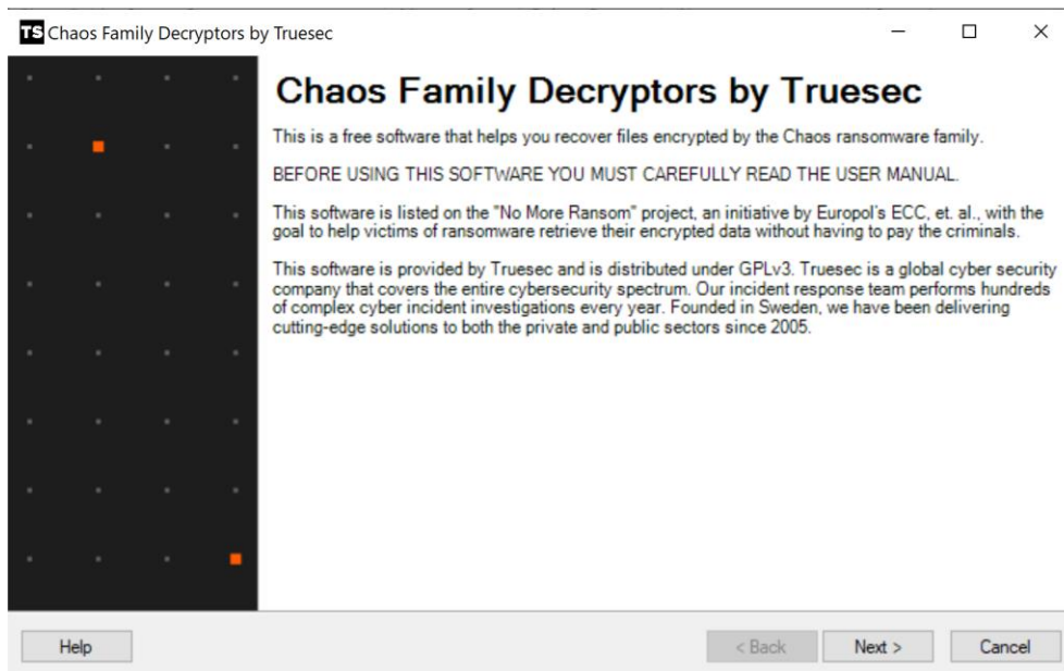
Figure 3 Welcome page