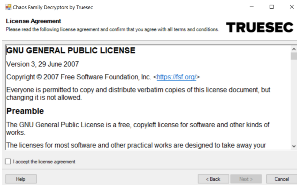
Figure 4 License agreement page

Carefully read the license agreement. You must accept the agreement to use this software.